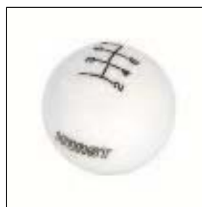
Black with 6-Speed pattern . . . . . 163 0156