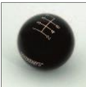
White with 6-Speed pattern . . . . .163 0056

The traditional Hurst Classic Shift Knob is available to fit your new Hurst Billet/Plus Shifter and compliment the interior of your Corvette. These quality crafted knobs measure 2-1/4" in diameter and are available in solid white with engraved black Hurst name and 6-speed pattern, or solid black with engraved white Hurst name and 6-speed pattern. Features a 9/16-18 threaded brass insert and supplied with a jam nut.